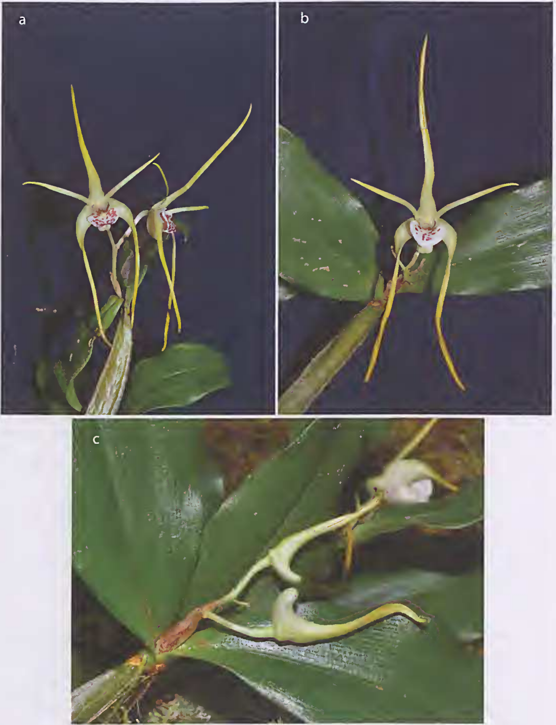
Figure 2. Photograph 2. D. tetragonum subsp. tetragonum var. serpentis a. flower ; b. another floral form; c. advanced buds showing prominent distal twisting